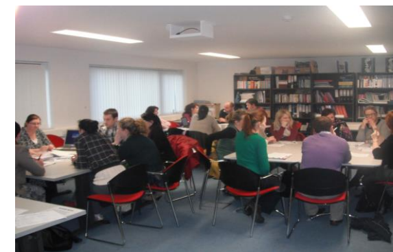
Instructional Leadership Workshop